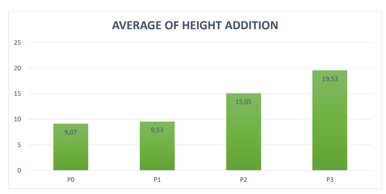
Figure 1. Average height addition of Turi seedlings

griculturalscience.unmerbaya.ac.id/index.php/agriscience/index