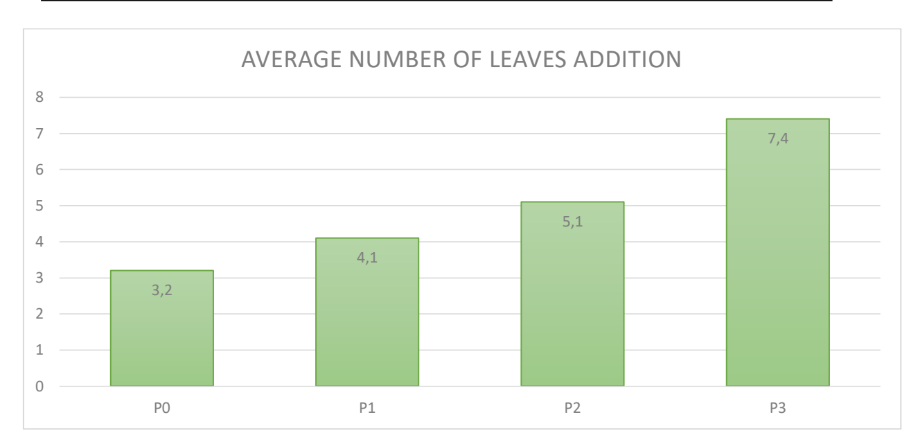
Figure 3. Average number of leaves addition

ttps://agriculturalscience.unmerbaya.ac.id/index.php/agriscience/index